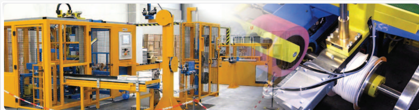
Cable Certification Center - Televes controls at its facilities every quality parameter of each meter of Trishield cable that it rolls.