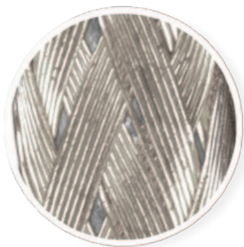
Ref.4138 COVERAGE 82%

REF. 4138 / 413801 / 413802 / 414801 / 414802